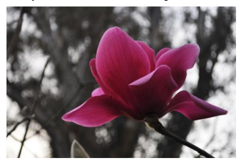
An Orchid blossoming at Holy Assumption Monastery

The many exotic plants that adorn the grounds of the monasterv will require special knowledge and for their skill nurture. Not to worry! Sister Mary is on hand!