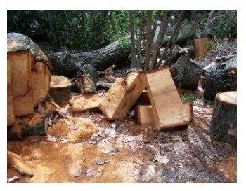
What do you mean we cut the wrong tree?